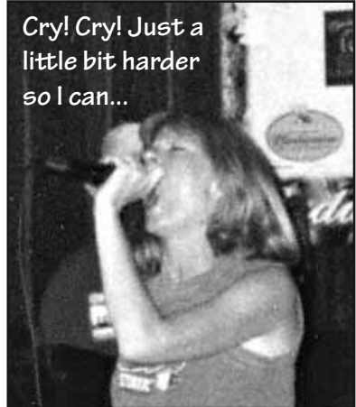
Cry! Cry! Just a little bit harder so I can... This redhead is pounding the pavement all over the county... She's having a birthday on February 16th so if you see her wish a good one!

NEWSPAPERS, aluminum cans for the Senior Services recycling project. Will pick up in Lanark and Milledgeville on the 2nd Saturday of the month, and Chadwick and Thomson on the 3rd Saturday. In Lake Carroll, take to the Conference Center Shed. In Mount Carroll, take to the Senior Center from 9AM to 1PM, Mon. thru Friday. 244-1800