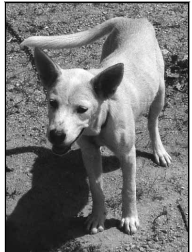
FOUND DOG Looking for owner. Call 815-493-2861

FAIRHAVEN FRUIT FARM: Apples and More! on the corners of Fair Haven & Creamery Roads, 4 miles East of Thomson, IL. New Varieties Ripening Each Week. Orchard Hours are Wednesday to Saturday - 9:00 a.m. to 5:00 p.m.; Sunday Noon to 5:00 p.m. Closed Monday & Tuesday. Phone 815-499-1856. www.fairhavenfruitfarm.com