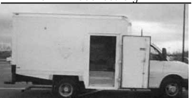
2005 CHEVY G3500, 6.0 Engine, AT, AC. 12'Lx8'Wx6'H Cargo Area. $9,000. 815-258-9997

LOCAL CREDIT UNION REPO FOR SALE - 2003 Ford Windstar Van 124,724 miles. $6825 NADA Retail Value, located at 214 N Jackson St., Morrison, IL 877-772-7215. www.adonecu.org.