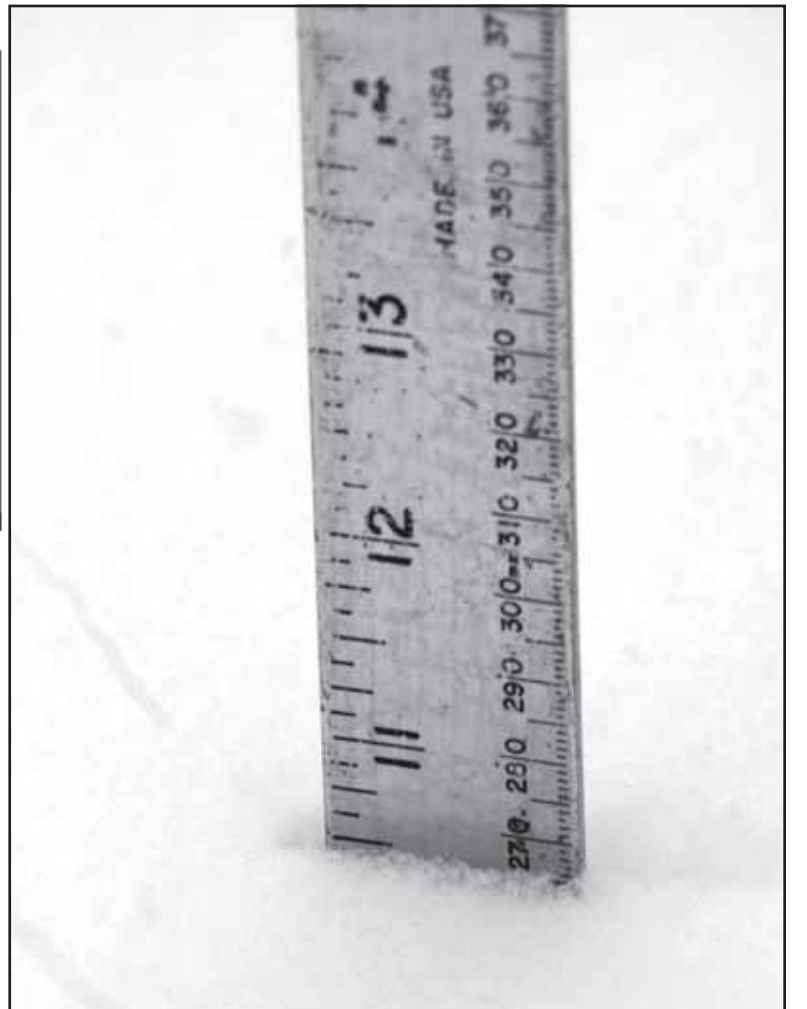
The ruler tells the story.. 10-1/2 inches of snow for the first measurable snowstorm of the 2009-2010 season, and winter doesn't officially arrive until December 21. Some areas in the PA distribution area were hit with more than a foot of snow, while some got 7 to 9 inches. By any measure, that's still a lot of snow. Check out the exclusive video at www.pacc.news.com

Apts. • Milledgeville Inquiries Call 815-225-7368 or 815-225-7334