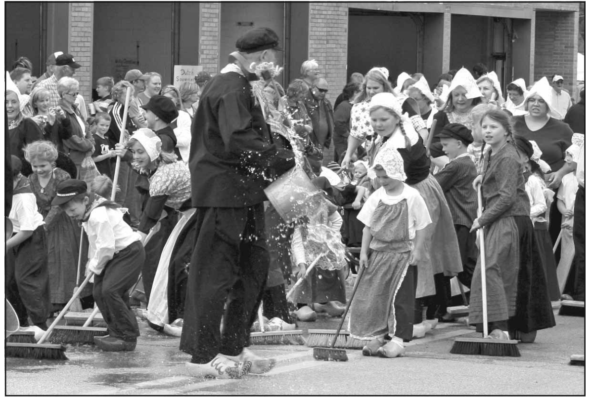
Scrubbers in authentic Dutch attire scrub the street in preparation for the Fulton Dutch Days annual parade. Dutch Days saw rain on Friday, April 30, but completed the festival Saturday in mostly sunny conditions. Visitors came from all around the Midwest to participate in the activities, see "De Immigrant" Dutch Windmill, sample authentic Dutch food, and just have fun.