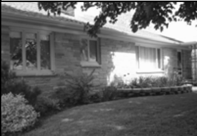
3 bedroom, 2 bath, new roof, fireplaces, lower level family room. $129,900