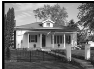
Large Corner Lot. $94,500. Completely renovated. All new flooring, 3 car garage.