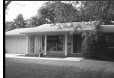
3 bedroom, 2 bath, finished lower level, 2 car garage, fireplace. $119,000