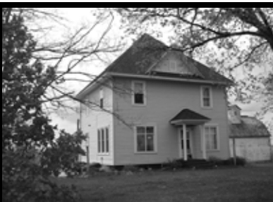
5 Acre Farmette with outbuildings. 3 bedroom home. Fenced pasture. $124,000