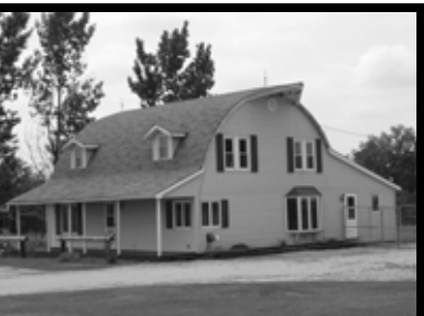
3 bedroom Barn-style home with 2 acres. Fenced pasture. Country Living. $94,900